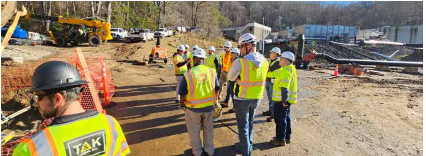
► BWJV crews work on emergency water pre-treatment systems in Asheville, NC, helping restore safe drinking water to the community following Hurricane Helene.

Bering-Weston Joint Venture (BWJV), a joint venture between BSNC company Bering Straits Global Innovations, LLC and Weston Solutions, Inc., provided emergency water pre-treatment services to the Asheville, NC, community following Hurricane Helene. Mudslides triggered by the hurricane caused the Bee Tree Reservoir, which supplies the William Debruhl Water Treatment Plant, to become highly turbid and noncompliant with drinking water standards, leaving thousands of residents without access to clean water.