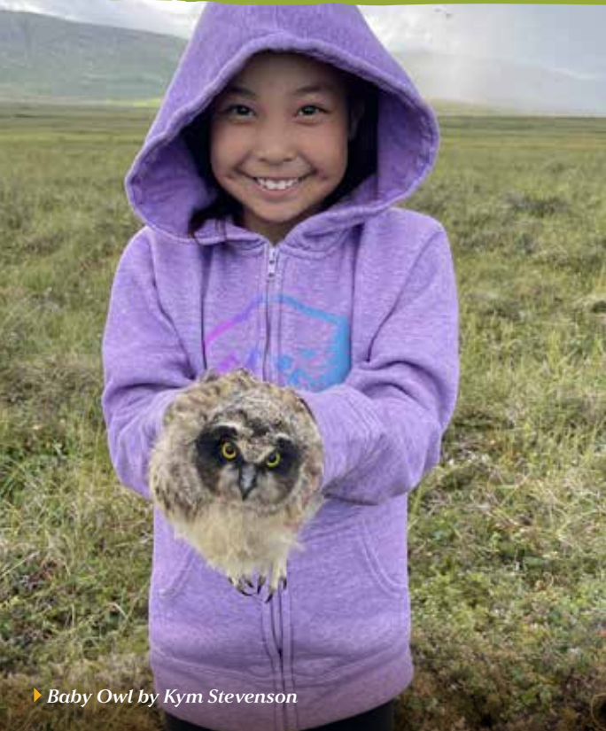
► Baby Owl