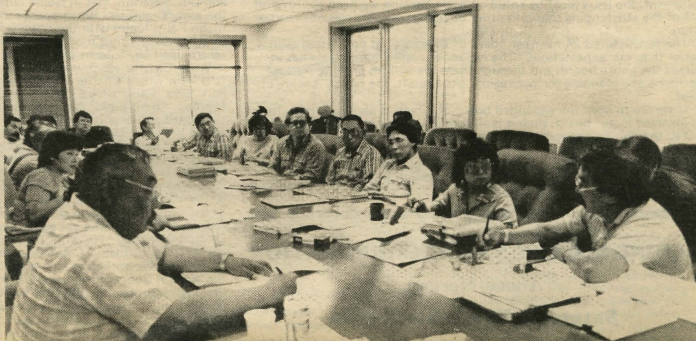
VERY IMPORTANT BUSINESS —At a September 10th meeting the BSNC Board of Directors met to approve the proxy statement, proxy cards and financial statements as part of the preparation for the November 3rd Annual Meeting.

Every BSNC shareholder will receive a packet of information including the 1984 Annual Report,