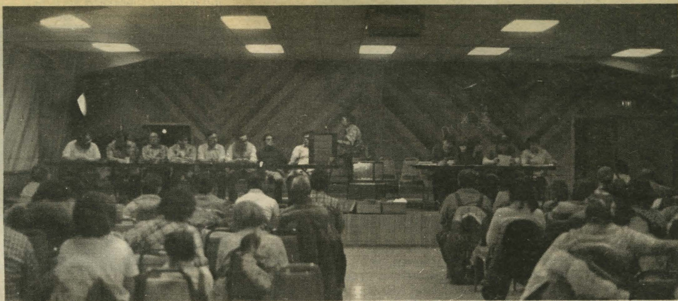
A PACKED HOUSE —Over 250 Shareholders attended the BSNC Annual Meeting Potluck at the Nome Elementary School gym