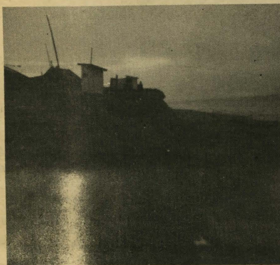
Village erosion of Shishmaref. Will the village be moved????