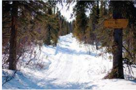
HISTORICAL 2nd) Rhoda Nanouk - "Iditarod trail"