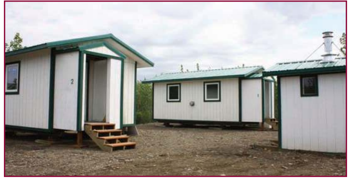
Cabins 1 and 2.

Contact BSNC at (907) 443-5252 or email Larry at lpederson@beringstraits.com for reservations and more information.