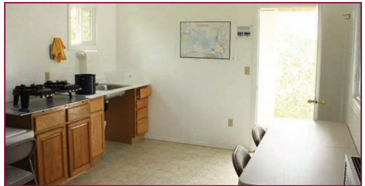
A look inside Cabin 1, which sleeps four people.