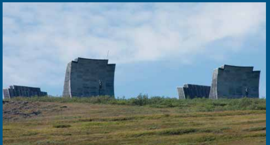
White Alice antennas atop Anvil mountain.

Beginning in the 1990's a debate occurred in Nome concerning whether the antennas should be removed or be left standing. The area immediately surrounding the antennas contained various contaminants, and the sheathing on the back of the structures contained lead paint and asbestos.