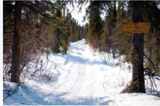
HISTORICAL 2nd) Rhoda Nanouk - "Iditarod trail"