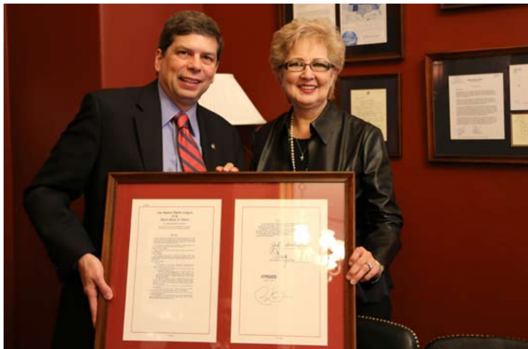
BSNC President and CEO Gail Schubert and Sen. Begich hold Salmon Lake legislation, which enabled BSNC to acquire lands surrounding Salmon Lake through selections made pursuant to the Alaska Native Claims Settlement Act of 1971.