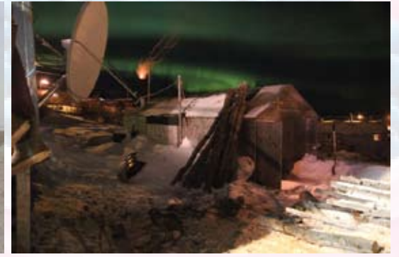
VILLAGE LIFE 3rd) Curtis Ivanoff - "Northern lights over village"