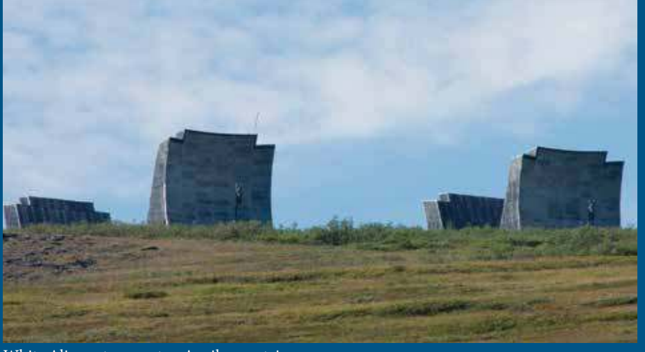
White Alice antennas atop Anvil mountain.

Beginning in the 1990's a debate occurred in Nome concerning whether the antennas should be removed or be left standing. The area immediately surrounding the antennas contained various contaminates, and the sheathing on the back of the structures contained lead paint and asbestos.