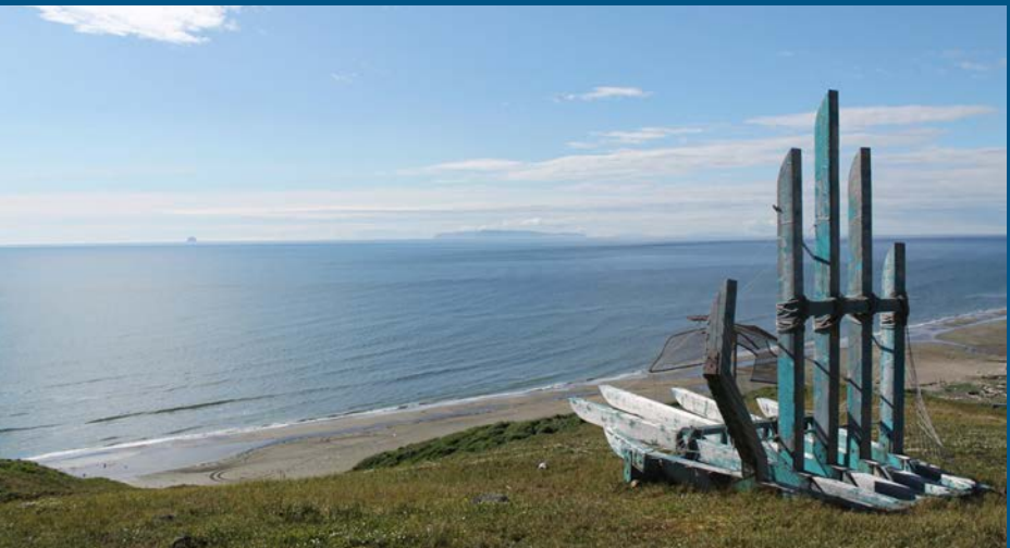
The “hand” in Kinjigin stands tall along the base of the mountain with open wooden hands joined at the wrist with a metal bird positioned as if in flight directly across to Naukan, Russia.