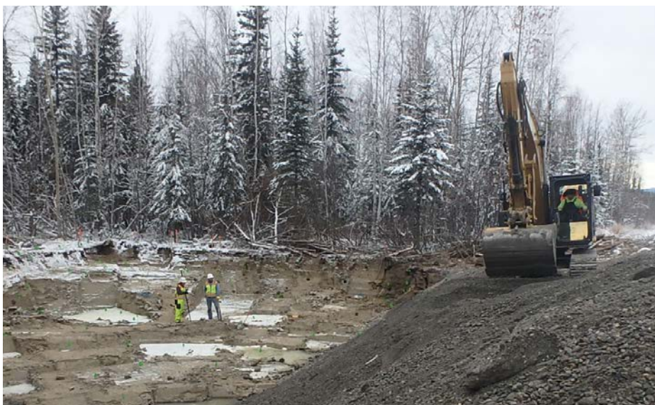
1,350 gallons of jet fuel from a truck rollover accident were excavated in Fort Wainwright, Alaska.

Last fall, BSNC subsidiary Paragon Professional Services, LLC (Paragon) was awarded a two-year contract with the U.S. Army Corps of Engineers to perform spill response activities in Fort Wainwright, Alaska. Tasks include providing response to prevent, contain, control, clean up, remove and dispose of hazardous waste and material. Paragon has responded to two releases that occurred mid-October. The first response consisted of a 20-gallon release of jet fuel, while the second response consisted of a 1,350-gallon release from a rollover accident involving a truck. The contaminated material is stockpiled in Fairbanks, Alaska awaiting treatment.