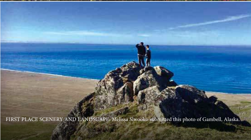
FIRST PLACE SCENERY AND LANDSCAPE: Melissa Slwooko submitted this photo of Gambell, Alaska.