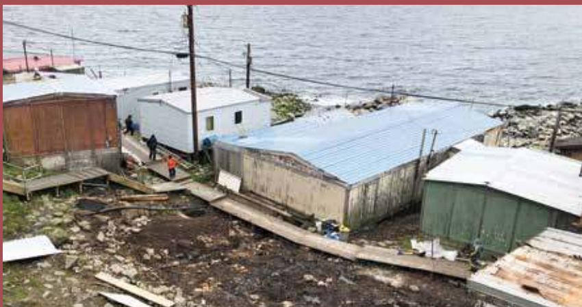
The open space is where the armory once sat.

BSNC subsidiary Eagle Eye Electric, LLC (Eagle Eye) recently completed a demolition and cleanup project in Diomedes for the State of Alaska Department of Military and Veterans Affairs. The project included demolition of the Alaska Army National Guard Federal Scout Readiness Center Armory. Constructed in 1960 when the Cold War was in full swing, the armory was the only site in the U.S. to have direct visibility and contact with the Soviet Union. Diomedes was one of the many strategic points in Alaska along the Arctic border that separated the Soviet Union from the U.S.