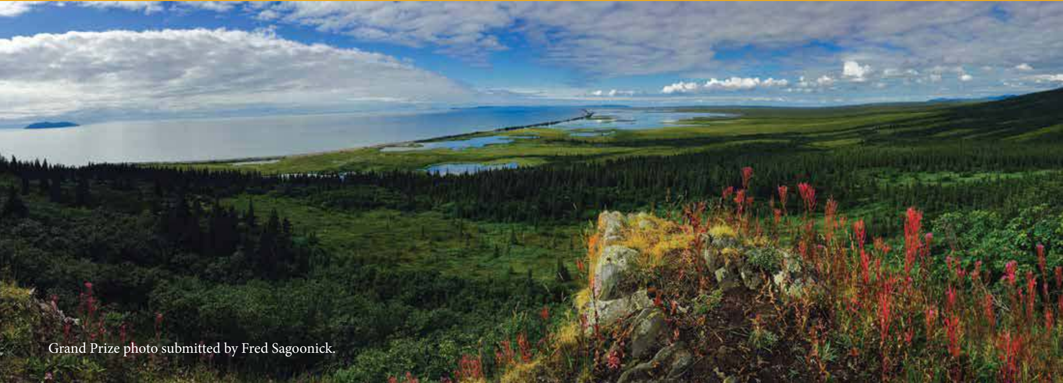
Grand Prize photo submitted by Fred Sagoonick.