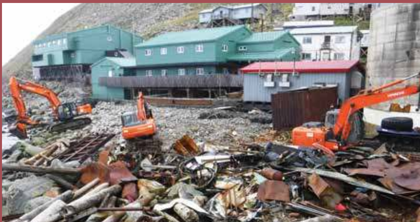
Old refuse from the island is removed.

BSNC subsidiary Eagle Eye Electric, LLC (Eagle Eye) recently completed a demolition and cleanup project in Diomedes for the State of Alaska Department of Military and Veterans Affairs. The project included demolition of the Alaska Army National Guard Federal Scout Readiness Center Armory. Constructed in 1960 when the Cold War was in full swing, the armory was the only site in the U.S. to have direct visibility and contact with the Soviet Union. Diomedes was one of the many strategic points in Alaska along the Arctic border that separated the Soviet Union from the U.S.