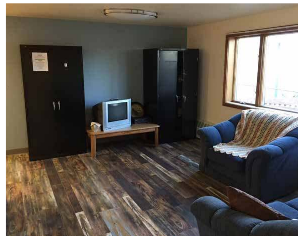
Iyabak Construction renovated the interior and exterior of the BSWG Shelter.

lyabak Construction, LLC, a subsidiary of Bering Straits Native Corporation, recently completed a major renovation to the Bering Sea Women's Group (BSWG) Shelter as part of the State of Alaska's Domestic Violence Shelter Deferred Maintenance Project. Located in Nome, BSWG is a nonprofit that provides programs and shelter for domestic violence victims. The shelter, originally constructed in 1959, was in a severely deteriorated state due to heavy use and limited funding.