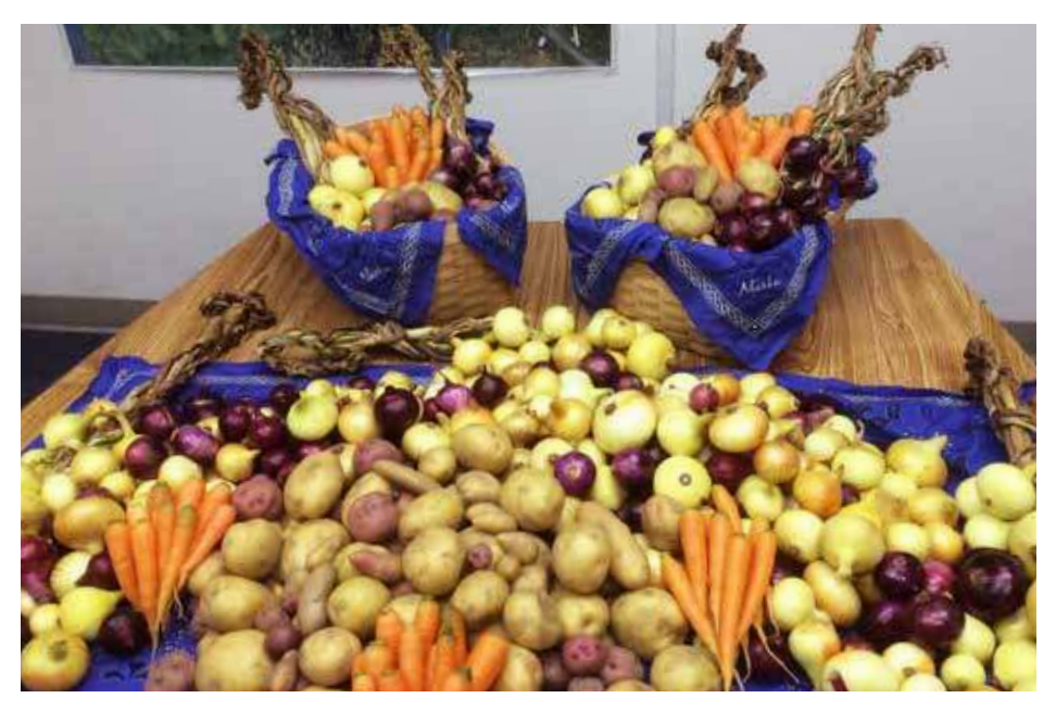
Vegetables harvested at Pilgrim Hot Springs were donated to Elders and those in need.

In 2015 BSNC, the managing member of Unaatuq, LLC, was awarded a U.S. Department of Agriculture Conservation Innovation Grant for a geothermal greenhouse at Pilgrim Hot Springs.