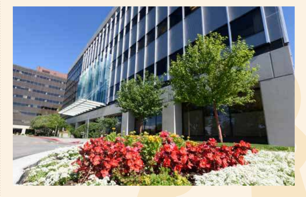
BSNC occupies the 3rd and 4th floors of the Calais II building. BSNC's new Anchorage office is located at 3301 C Street, Suite 400, Anchorage, AK 99503.

BSNC invites shareholders and descendant to its Open House and Holiday Bazaar taking place on Thursday, Nov. 30 from 5-7:30 p.m. at 3301 C Street. The Open House and Holiday Bazaar will feature refreshments as well as arts and crafts tables by BSNC shareholders and descendants.