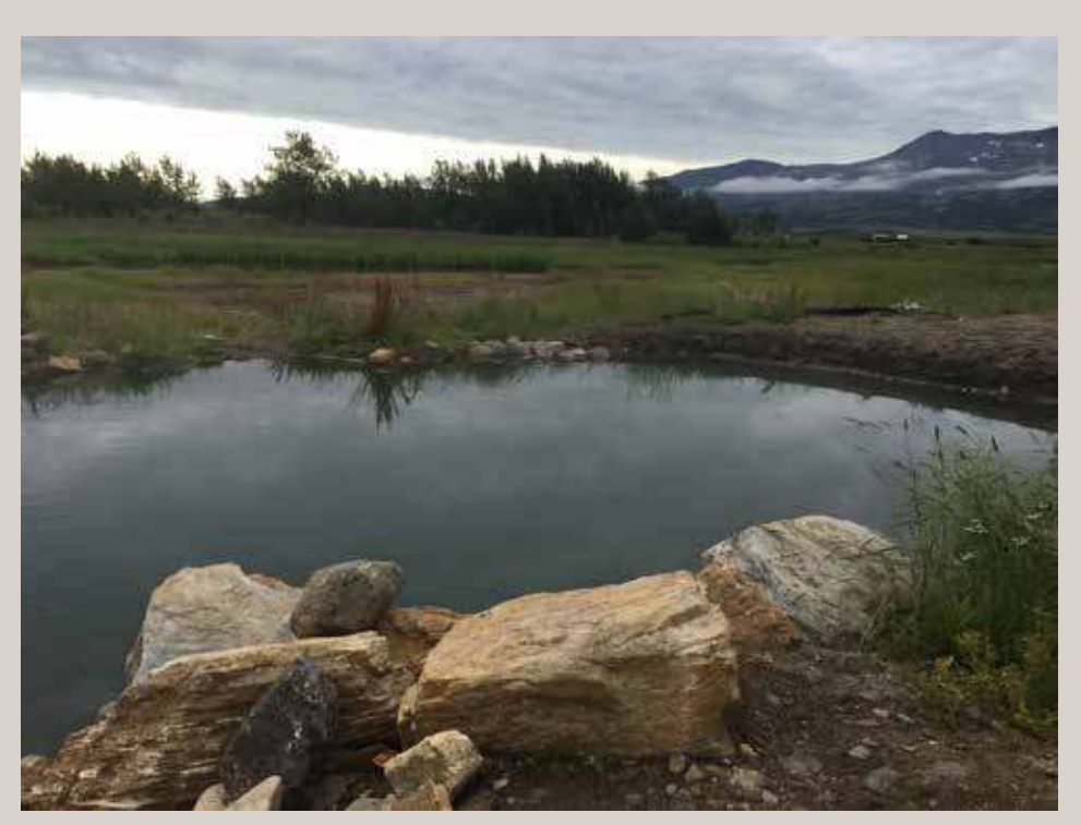
Pilgrim Hot Springs

It is also important that visitors do not venture off the road as they travel to the springs. The surrounding lands along the road belong to BSNC, Mary's Igloo Native Corporation and the Bureau of Land Management. Please be respectful of Native corporation lands and avoid trespass. Maintaining public use of the springs is important and can only be continued if visitors respect the land and clean up any