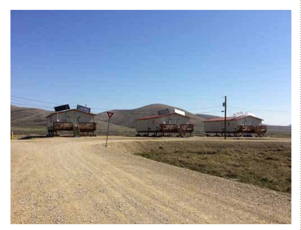
Bering Straits Development Co. built five energy efficient homes in Brevig Mission.

Bering Straits Development Company (BSDC) has completed the construction of five highly energy-efficient and element resilient homes in Brevig Mission. Bering Straits Regional Housing Authority partnered with BSDC and the Cold Climate Housing Research Center to construct the homes utilizing the "Integrated Truss" design model.