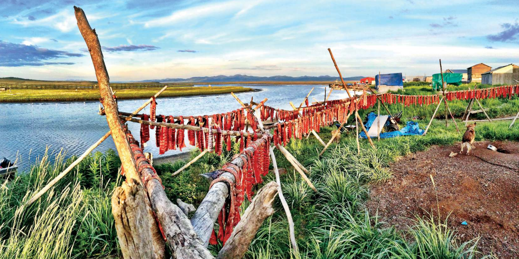
BSNC descendant Sam Towarak of Unalakleet submitted the grand-prize-winning photo, “Lorena Paniptchuk’s dried fish hanging.”