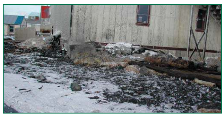
Flood debris by the Assembly of God Church.