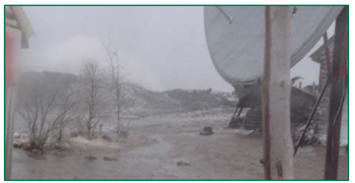
Water and logs cover the road nearest the ocean in Unalakleet.