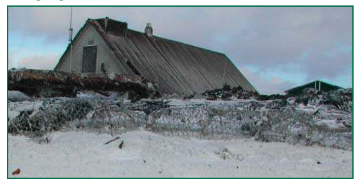
The storm water emptied the gabions in front of the 108 year old church. The gabions are wired mesh that are filled with rock to help protect the land from water damage.