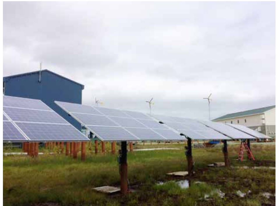
BSDC's solar project in Bethel, Alaska.

Visit www.beringstraits.com/about-us/donation-policy/ to learn more about BSNC's charitable giving policy and www.beringstraits.com/about-us/community-engagement/ to view BSNC's community engagement report.