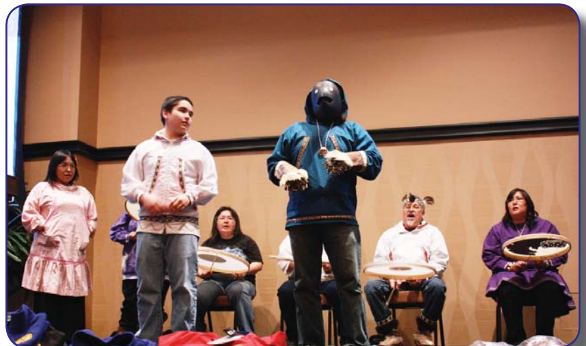
The Northwest Inupiaq Dancers performing the "Raven Dance."