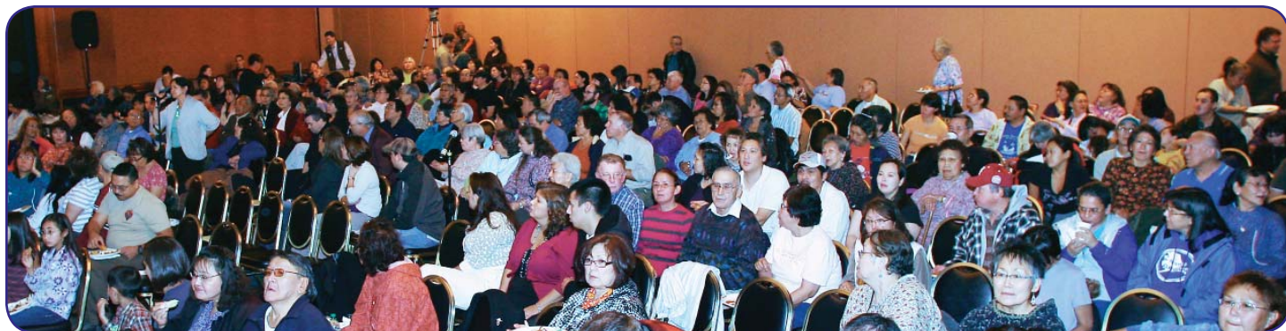
300 Shareholders attended the 36th Annual Meeting of Shareholders held in Anchorage on October 9.

from the Cornell University School of Law and is licensed to practice law in New York State and Alaska. Since her return to Alaska, in addition to the BSNC board, she serves on the boards of several other Alaska organizations including AFN, the Alaska Native Heritage Center, Alaska Native Justice Center, and the Alaska Retirement Management Board.